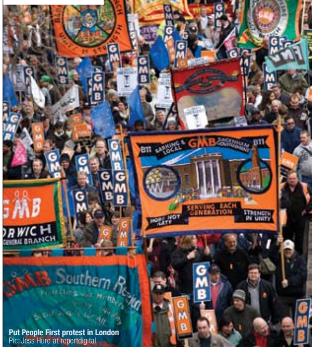
Put People First protest in London