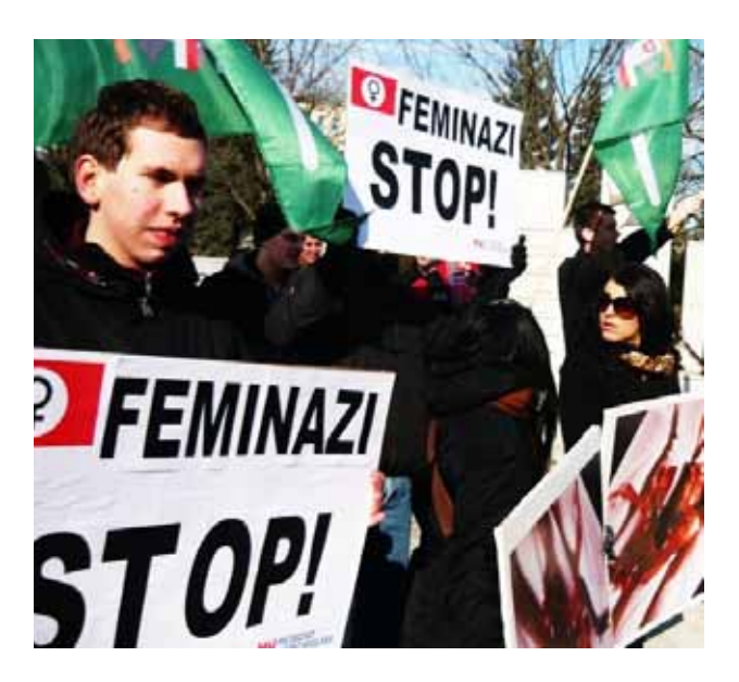
At an All-Polish Youth demonstration, protestors carry, amongst other things, pictures of aborted embryos.

Another issue being flagged up by researchers is that while women have always been active in the far Right, they are increasingly playing a more prominent role. This is most obvious in Germany where women now account for an estimated one in five neo-Nazis, but it was also flagged up in the Czech Republic where fifteen women have been accused of various offences, including raising funds for jailed neo-Nazi 'prisoners of war', arising from their association with the Resistance Women Unity (RWU), an offshoot of the National Resistance. (Národní odpor - NO). 180 Traditionally, women's role within fascism was, in accordance with the Lebensborn, to bring up children and maintain the purity of the Aryan race. Researchers studying the role of girls and women in fascism in Germany today have noted the 'Prussian rigidity with which mothers raise their children, glorifying discipline and the German tradition'.181 But women also play an active role in far-right structures. A women's organisation, the Ring of National Women (Ring Nationaler Frauen - RNF) was