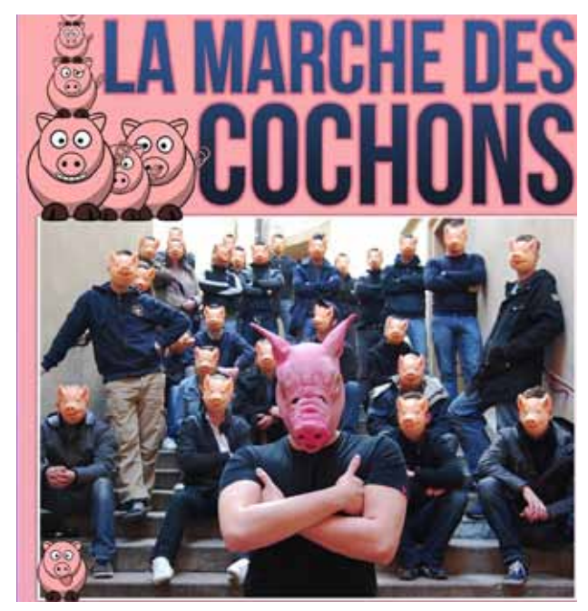
Across Europe, mosques are attacked, women are spat at and abused for wearing the hijab, and Muslims are regularly baited at events like the 'march of the pigs'.

The Autonomous Nationalists, the Free Forces, the Nordic Youth, the National Resistance, Free Comrade-