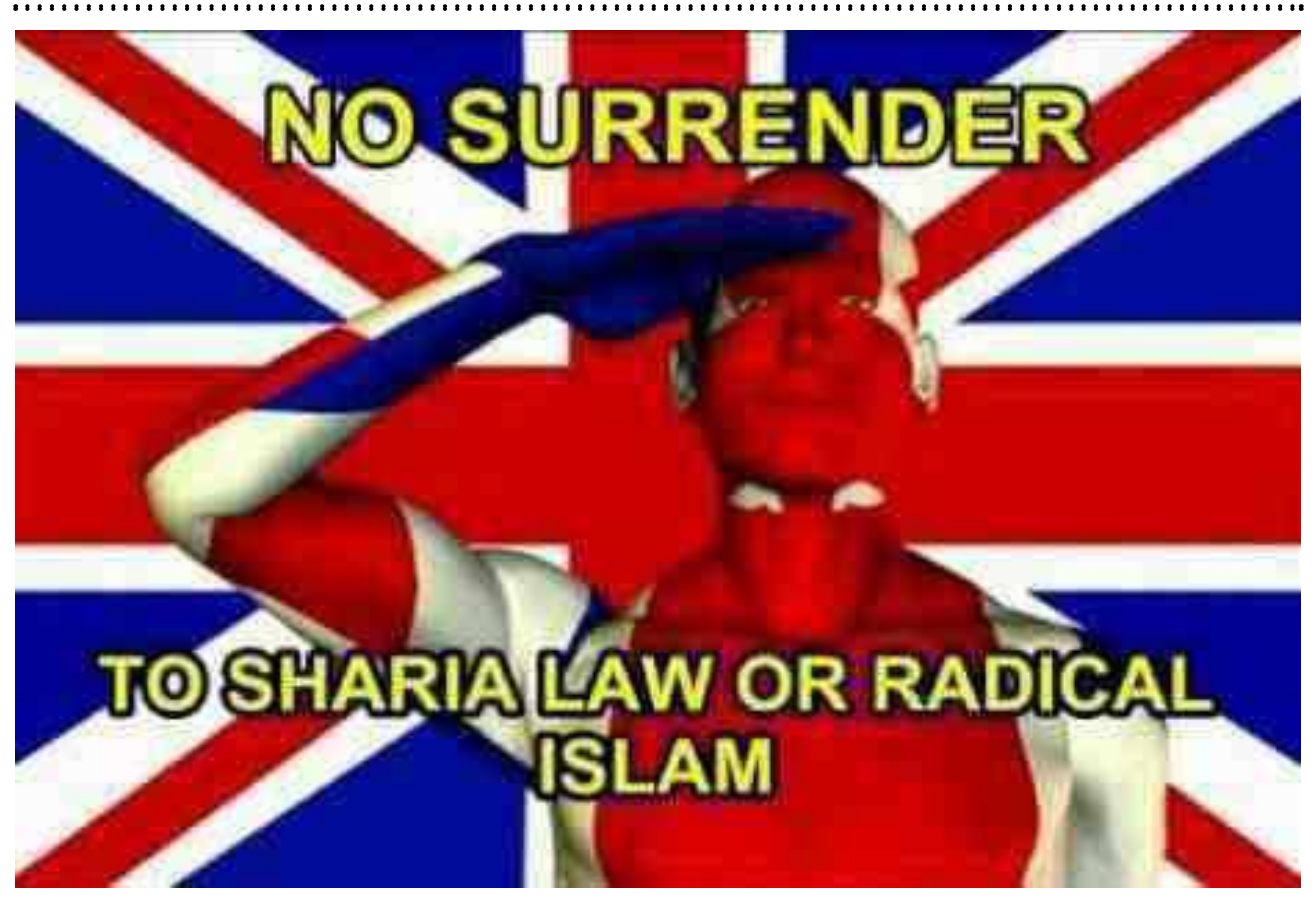
In the UK, the EDL and Casuals United have emerged as pro-war movements that claim to speak for our 'heroes' in Afghanistan and Iraq.

increase in racist incidents involving the armed forces; the Munich First Squad was investigated after allegations that right-wing behaviour was rife.