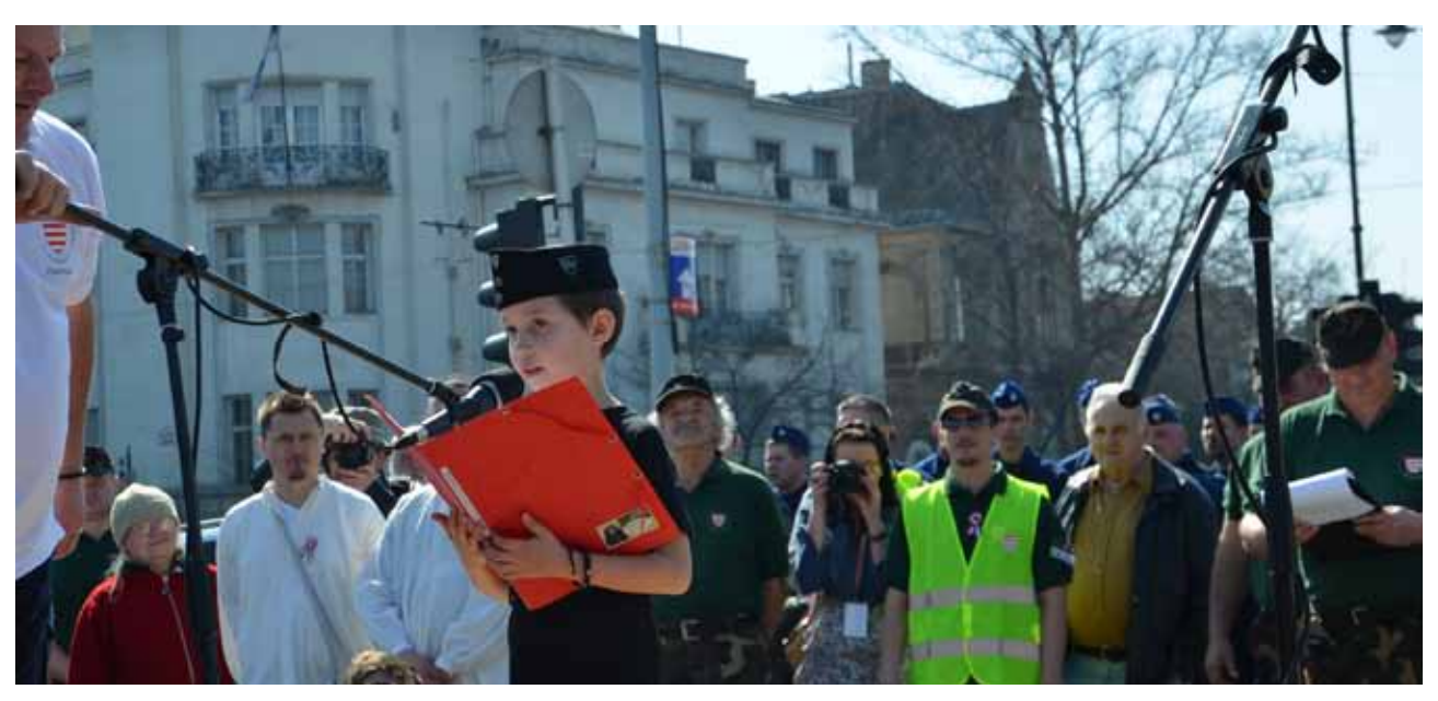
The next generation in Hungary are being indoctrinated into the politics of anti-Roma hatred.

In choosing to locate themselves in rural areas,