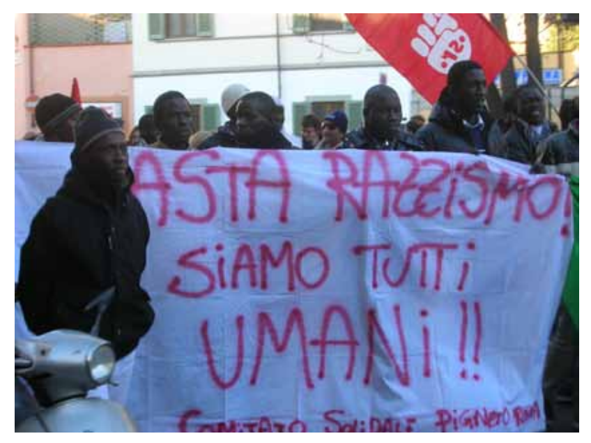
Demonstrators march near the Piazza Dalmazia marketplace, Florence after two Senegalese street vendors were shot dead by a far-right sympathiser in December 2011.

While nearly all the mainstream electoral extremeright parties have moved away from classical anti-Semitism, expressing unqualified support for the state of Israel's occupation of the Palestinian territories and professing a new-found 'philozionism' (love of Zionism),9 many (but by no means all) of these looser far-right networks are classical anti-Semites. They deny the Holocaust and seek to establish nationalistic narratives which omit the history of any collaboration with the Nazis and pogroms against the Jews in the period when the Third Reich dominated much of Europe. While the counter-jihadi network is first and foremost anti-Arab and anti-Palestinian, many of the more hard-core far-right groups we identify in this report believe that they have been betrayed by the pro-Israel extreme Right. As the case-studies demonstrate, this element of the far Right has stepped up its vitriol against Jews and attacks on Jewish targets. But despite a message - sometimes overt, sometimes by innuendo that is decidedly anti-Semitic, the main targets of such groups are the Roma in eastern Europe and Muslims in western Europe. There are of course country variations. In southern Europe, in particular, asylum seekers, sans papiers and migrant workers are the targets of the rising nationalism, with the mainstream anti-immigration agenda fuelling attacks. These are all the more terrifying for those without official papers who cannot