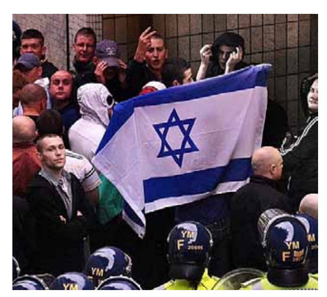
The English Defence League regularly sports Israeli flags at demonstrations and attacks those campaigning for Palestinian rights.

The EDL also targets (as the extreme Right did in the 1970s) trades unionists, anti-globalisation and anti-cuts movements, as well as those campaigning for Palestinian rights. In June 2010, the Palestine Solidarity Campaign stall in Birmingham was attacked and