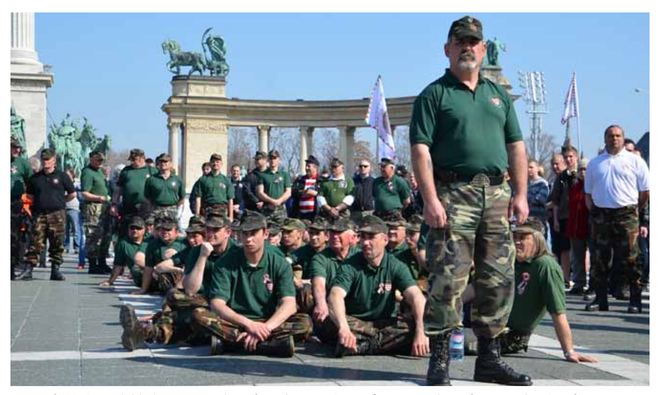
17 March 2012 – an initiation ceremony in Budapest's Heroes Square for new recruits to the Hungarian Guard.

Hungary: Jobbik went further than this in 2007 to form its own private militia, the Hungarian Guard (Magyar Gárda),<sup>129</sup> which was soon compared to the Arrow Cross, Hungary's Second World War fascist militiamen, who collaborated with the Nazis in killing tens of thousands of Hungarian Jews. This first attempt by Jobbik to form its own private militia was thwarted as the courts declared it illegal and banned it on the grounds that its militaristic demonstrations generated ethnic tensions and constituted a threat to public order. Now a new paramilitary squad, the Civic Guard Association for a Better Future (Szebb Jövőért