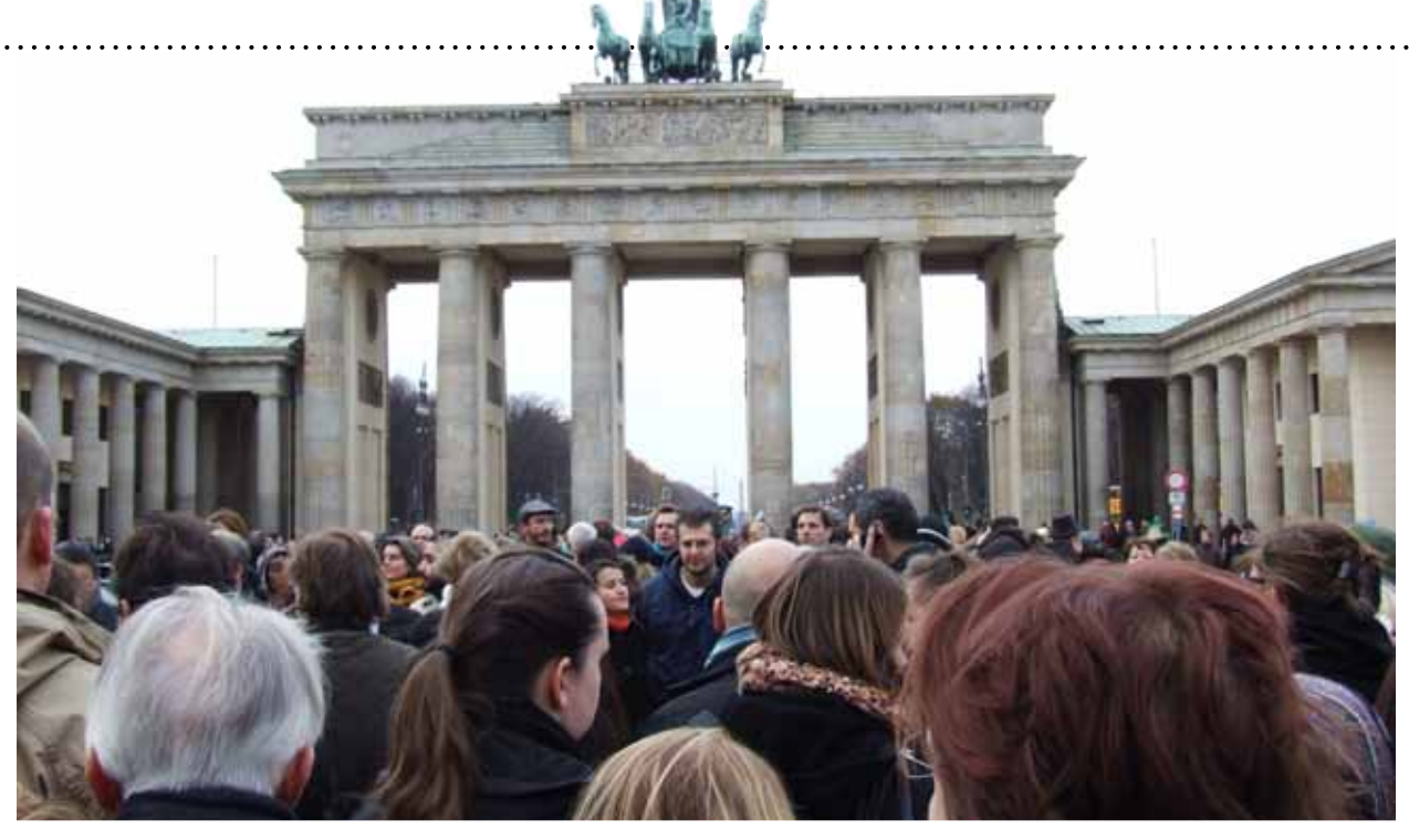
On 26 November 2011, memorial events took place in at least eleven German cities to remember the victims of the National Socialist Underground. The aim of the 'Silence Against Silence' protest was to send a message to the 'silent majority in Germany' that they must do more to oppose racism and fascism.

being a traitor who has embraced multiculturalism. The DDL's motto is 'If you wish for peace, prepare for war'.<sup>34</sup>