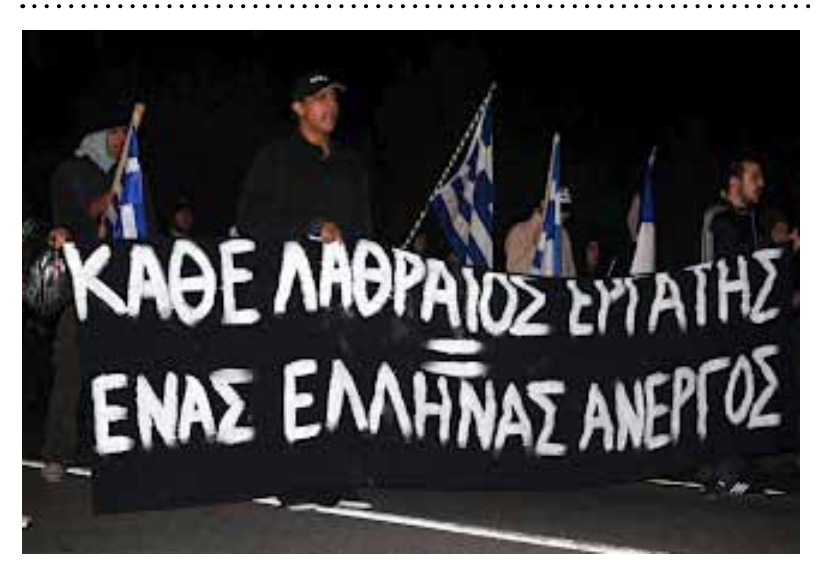
The Greek Popular Front demonstrate carrying a banner 'For every illegal immigrant – one Greek unemployed'.

with swastikas and the European Network Against Racism drew attention to the April 2010 attack on a building of the Palestinian community in Larnaca.<sup>77</sup> KEA refers to KISA as a 'social abscess' and 'a fifth column'.