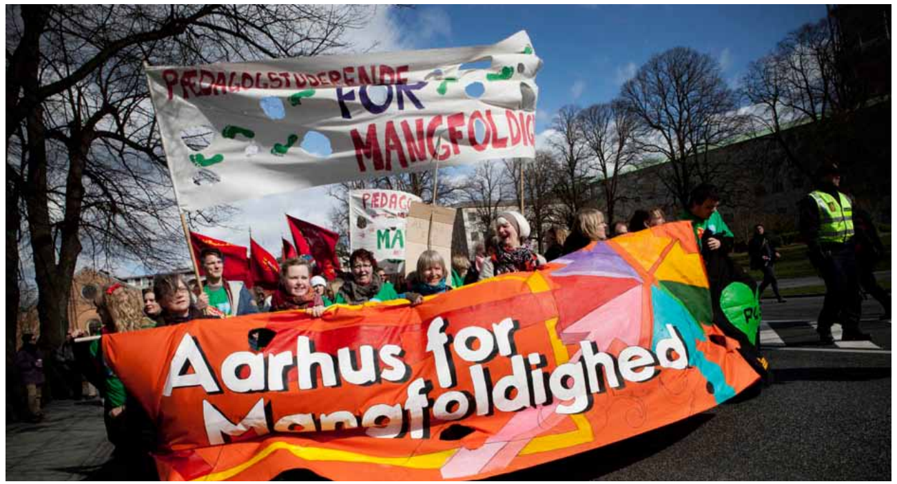
On 30 March 2012, around two hundred members of the Danish and English Defence Leagues held an anti-Islam, anti-multiculturalism rally in Aarhus, the second largest city in Denmark. An estimated five thousand counter-demonstrators gathered under the slogan 'Aarhus defends diversity'.

The picture of such groups and networks on the