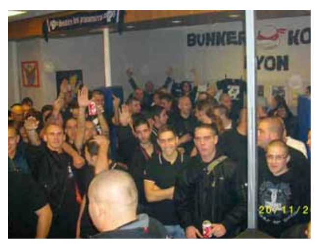
Lyons far-right activists have been linked to Blood & Honour. Photo taken from report Lyon Dissident: Un local néo-nazis ayant pignon sur rue.

The decision to re-launch the Polish version of Redwatch came after a Blood & Honour rally. And members of the Blood & Honour division Bohemia, as well as Combat 18 were amongst those arrested in the March (see page 13) coordinated raids on neo-Nazis in the Czech Republic with the Organised Crime Detection Unit now linking those arrested to plans to launch attacks on buildings and individuals. Blood & Honour also seem to have formed cells in France, where the Lyons branch of Blood & Honour (better known as the Lyons Dissenters) were linked, alongside the Lyons branch of the National Identity League (now known as Rebeyne) to several nasty attacks on antifascists. 123 (see page 16). And Blood & Honour has also opened its first branch in Italy, having previously been represented by the Veneto Fronte Skinheads, which has been active since 1986. According to Searchlight, Blood & Honour have taken over the office of the neo-Nazi SPQR Skin, describing themselves as the 'Italian